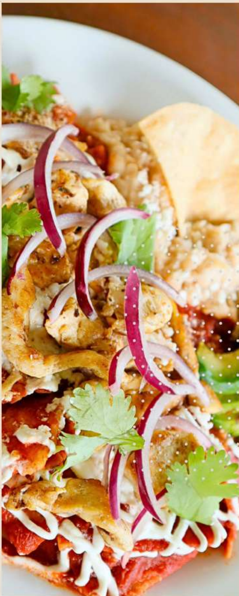
CHILAQUILES WITH CHICKEN

MINI EGG BURRITO OR SHERDDED MEAT VERSION $55 (SERVER ALONE)