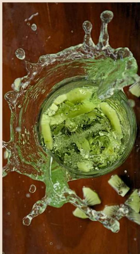
KIWI ITALIAN SODA