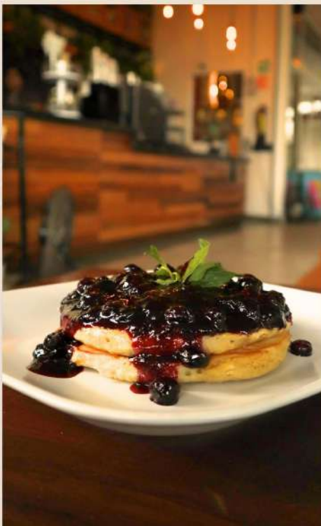
BLUE BERRY PANCAKES