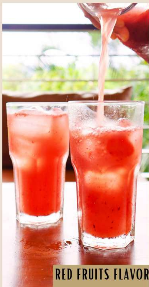
RED FRUITS FLAVOR

SODA CANS COCA COLA $27 DIET COKE $27 ZERO SUGAR COCA COLA $27 FANTA $27 SPRITE $27 SIDRAL MUNDET $27 FRESCA $27 TOPO CHICO MINERAL WATER $27 FUZE TEA $27