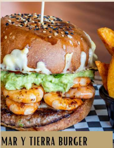
MAR Y TIERRA BURGER